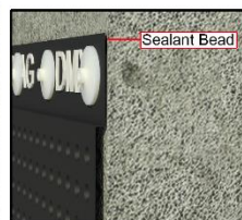
DETAIL 1 Sealant bead to be placed at the top of the flat tab.