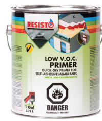
LOW V.O.C. PRIMER