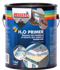
H 2 O PRIMER